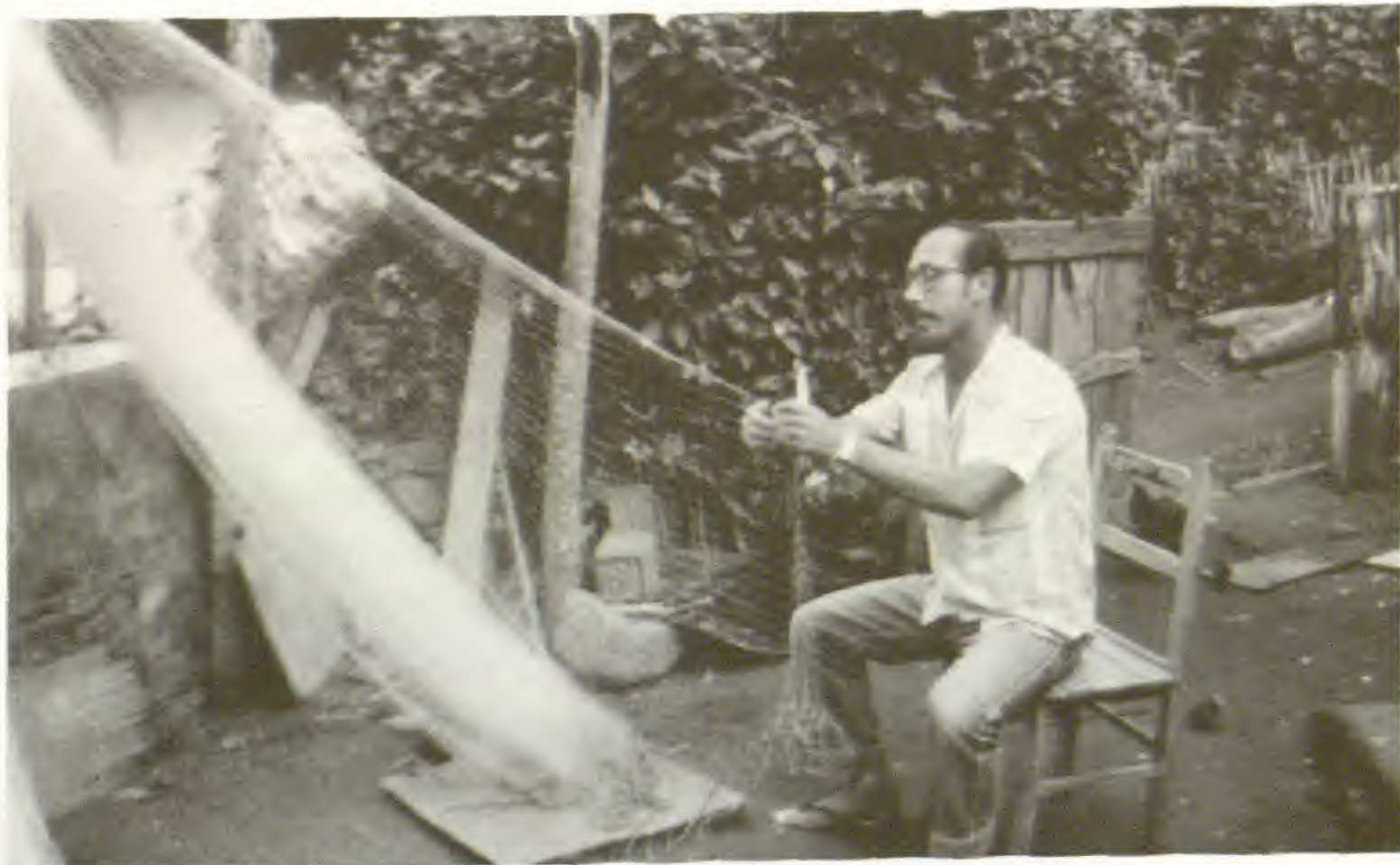
FIGURE 4.—Gamboa fisherman manufacturing a nylon net.

Interviews were based on questionnaires that included such general questions as: "How did you learn about fish names?" "What are the relations among fish species (if any)?" "How are they assembled in groups?" We included as well questions on fish diet and habitat. Interviews were conducted at fishermen's houses while fishermen were doing daily tasks, such as cleaning, sewing, or manufacturing nylon nets (see Figure 4).